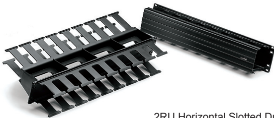
2RU Horizontal Slotted Duct