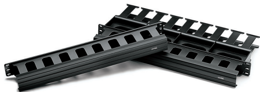
1RU Horizontal Slotted Duct

The Versi-Duct Horizontal Cable Management System uses slotted ducts to route cable. The ducts come with concealing covers and an assortment of cable management accessories. They mount onto a standard 19-inch equipment rack.